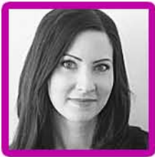
Kelly Brogan, MD

Parenting Through Cold & Flu Season: An Open Conversation with Four Acclaimed Experts We'll discuss immune boosting strategies, cold medicines and vaccines, and how to build your own natural medicine cabinet.